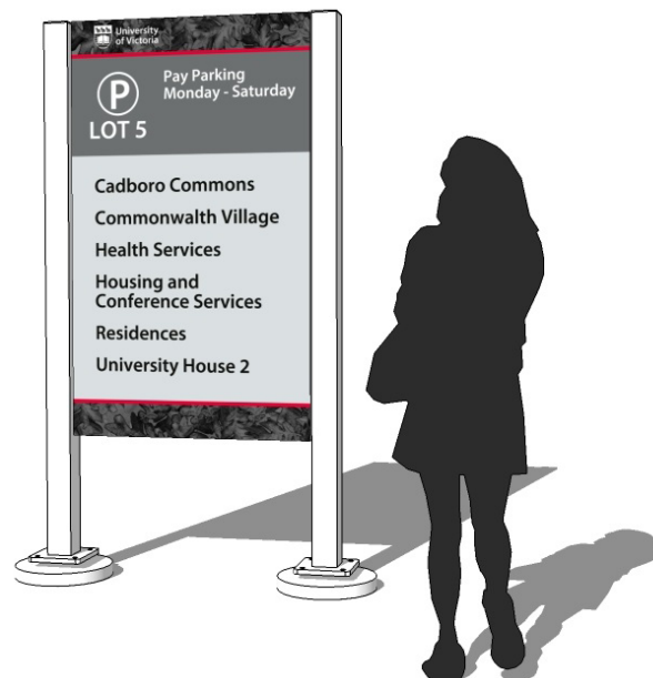
Parking Lot [Sign 2C]