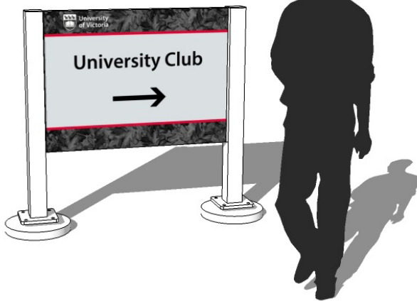
Directional [Sign 6A - Version 2]