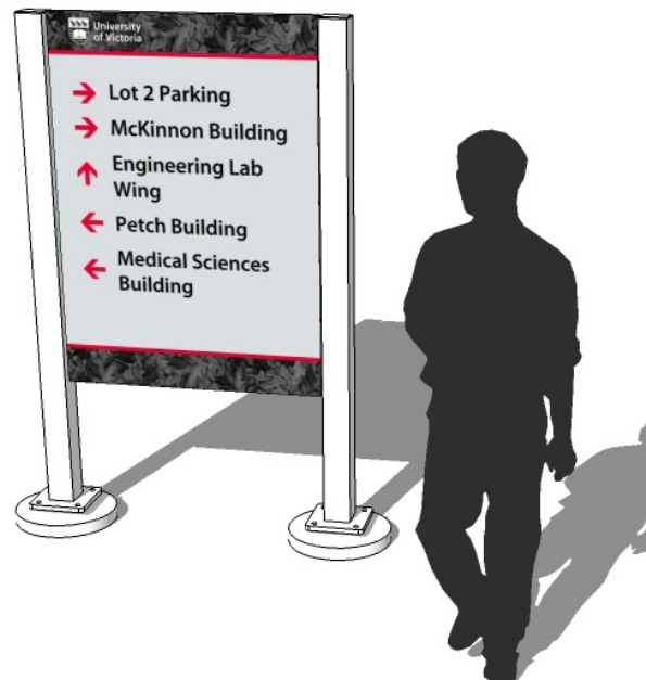
Directional [Sign 6B]