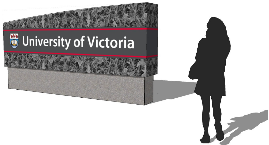
Main Gateway [Sign 1]