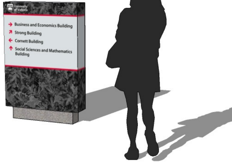
Intermediate Directional [Sign 10]