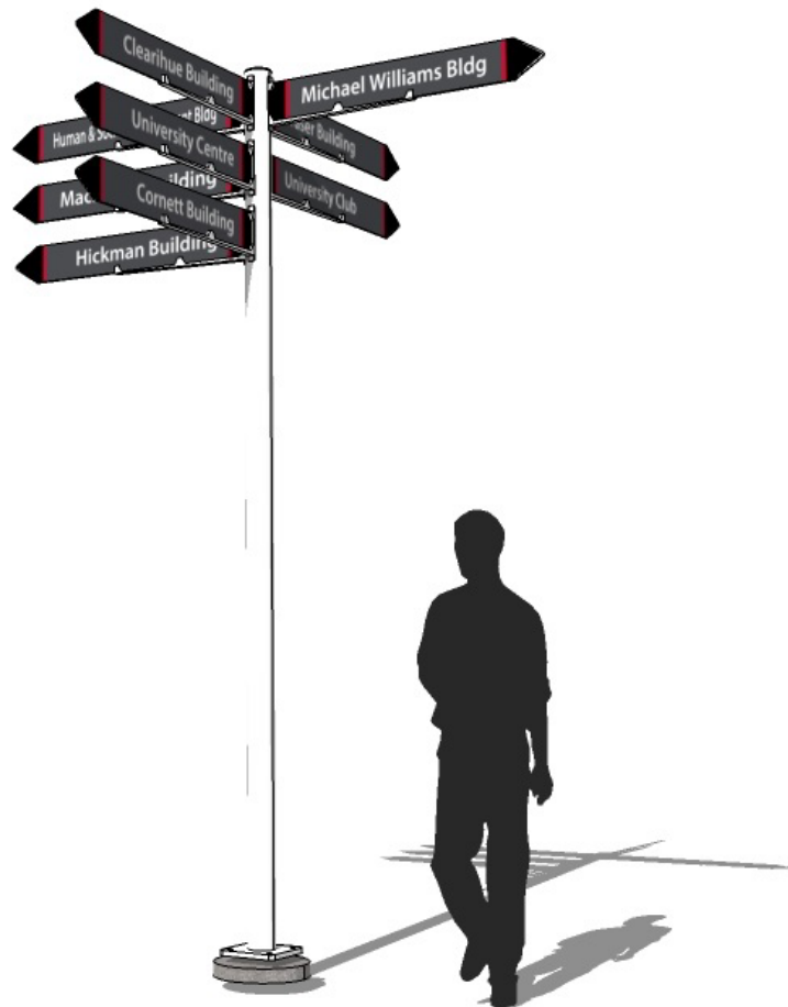
Street Blade [Sign 11]