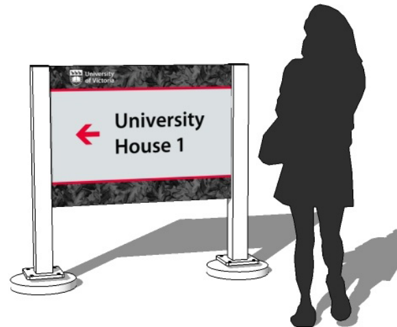
Directional [Sign 6A - Version 1]