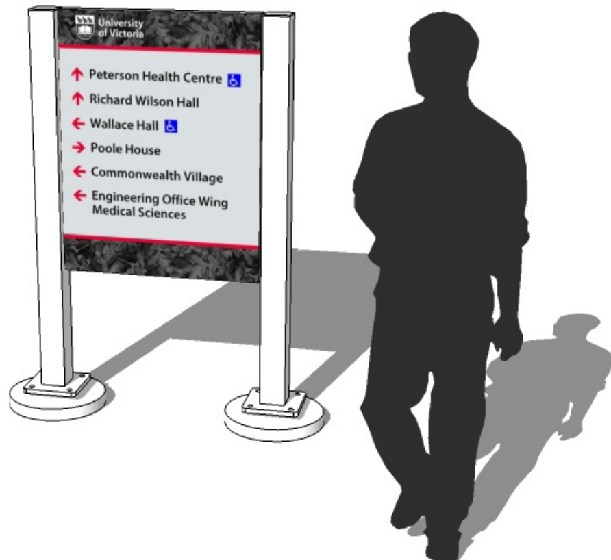
Minor Directional A [Sign 12]