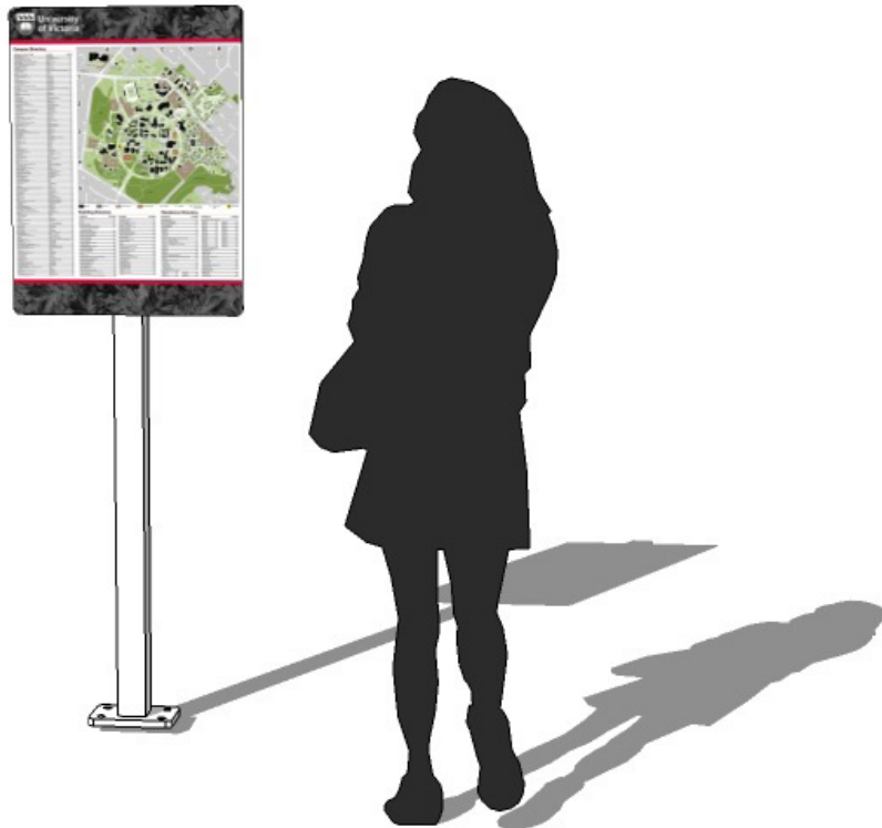
Minor Pedestrian Map [Sign 15]