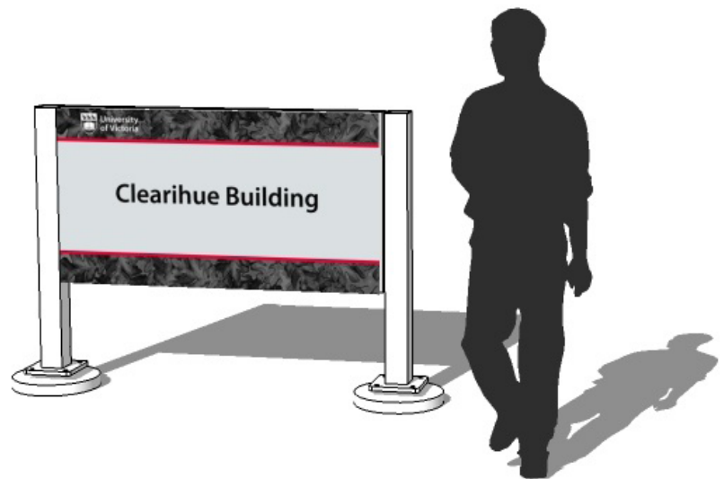
Building Identification [Sign 3A]