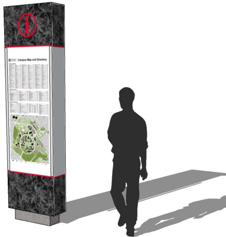
Major Directional [Sign 9]