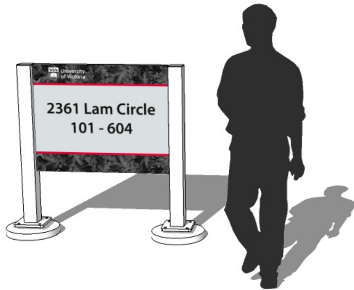
Building Identification [Sign 3B]