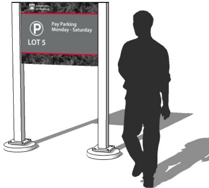
Parking Lot [Sign 2A]